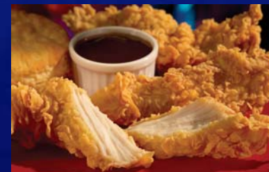
Baja Fresh, California Pizza Kitchen, and Popeyes chicken are among the new dining options at McCarran.