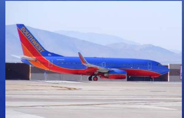
A Southwest Airlines aircraft is poised for the first departure on McCarran's resurfaced Runway 25L/7R in this photo taken April 29.

Most of the material removed from the job site was recycled. Overall, crews building the runway and its adjacent taxiways poured as much new material as would have been needed to build a 5-foot-wide sidewalk from Las Vegas to Portland, Oregon.