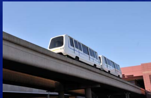
One of McCarran's four new Automated Tram System trains makes its way to Terminal 1.

Separately, McCarran and Bombardier Transportation have successfully replaced the Automated Tram Systems that run between the airport's main terminal and the C and D Concourses.