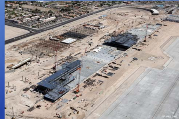
Construction workers are busy installing Terminal 3's steel superstructure, roadways and parking garage.

This summer, Terminal 3 will continue to take shape as its steel superstructure, surrounding roadways and parking garage edge closer to their scheduled opening three years from now. In the interim, thousands of skilled workers are earning their paychecks on this bustling job site.