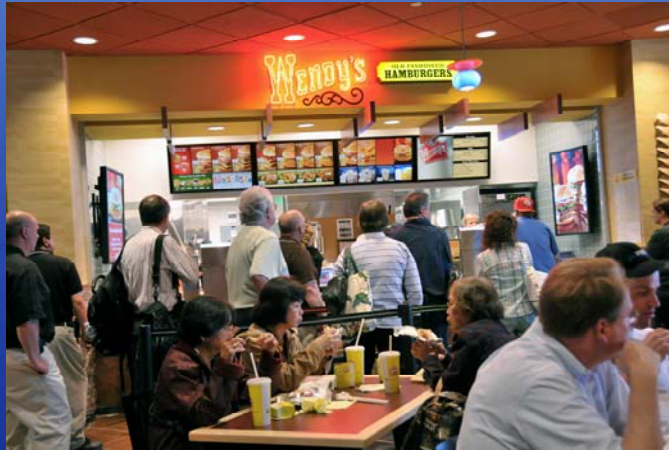
Travelers in McCarran's C Concourse line up to eat at the airport's first Wendy's, pictured above. Sammy's Beach Bar & Grill, below, recently opened nearby.